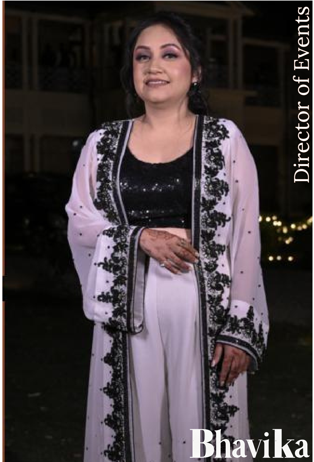
Director of Events